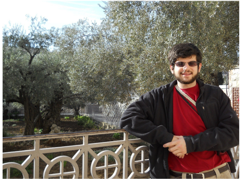
At the Mount of Olives in Israel.

After five months back in America, I still feel the draw of a place that is not my home, but to which I feel bonded by my love for history. I studied in the Middle East last term, and for a time was able to be both an historian with his nose in musty textbooks and an adventurer in a new fedora. The Middle East Studies Program was abnormal last spring: the Egyptian Revolution altered the itinerary. Still, I would not trade the experience for anything in the world. Walking in the Valley of the Kings, through the remains of a civilization literally as old as history itself, was beyond comparison, and it alone would have made an unparalleled experience. But to be part of history in the making—to see a government toppled (albeit from a safe distance) because of grievances accumulating over the last century—is indescribable.