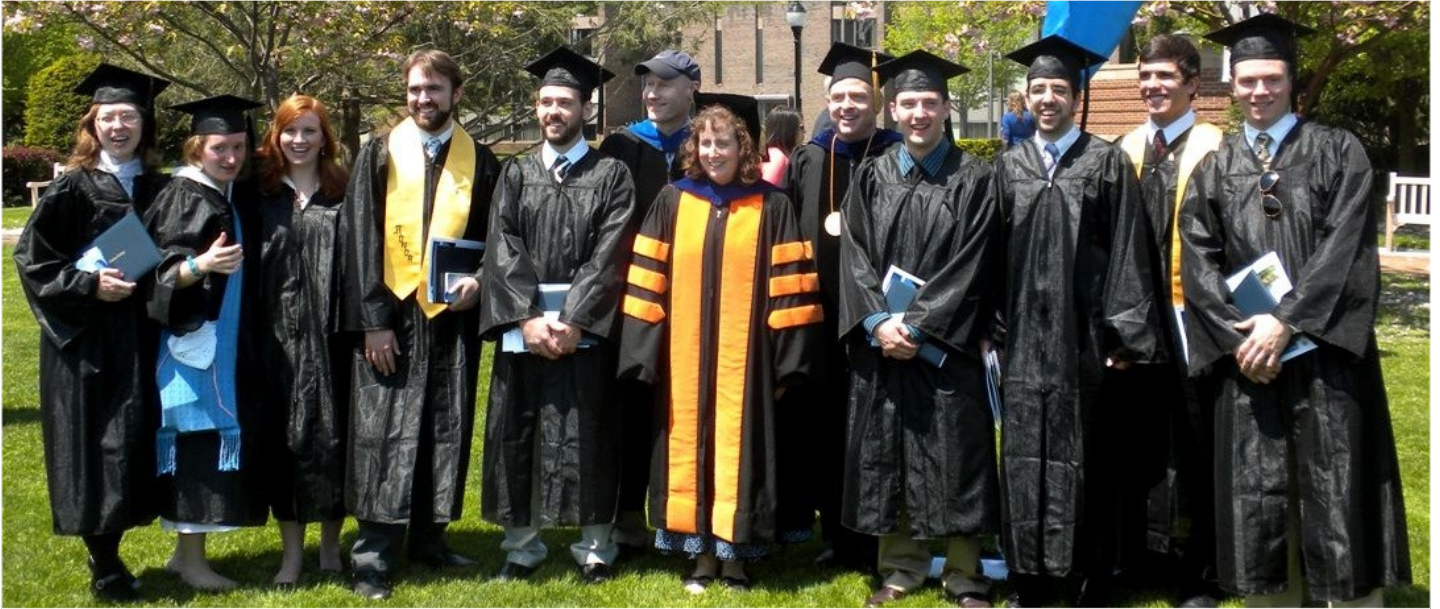
History's 2011 graduating class.